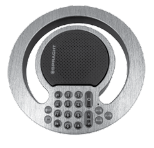
Aura SoHo<sup>™</sup> Conference Phone